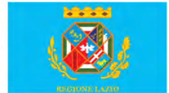
Flag of Lazio

The Region of Lazio, located in central Italy, is a captivating area renowned for its rich history and cultural significance. It is home to the iconic city of Rome, the nation's capital, which boasts landmarks such as the Colosseum, the Vatican, and the Pantheon, each a testament to the region's profound influence on art, architecture, and religion throughout history.