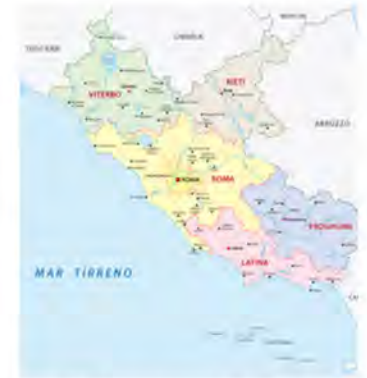
The 5 provinces in Lazio region (Frosinone, Latina, Rieti, Roma, Viterbo)

Beyond Rome, Lazio encompasses charming cities like Tivoli, famous for the stunning Villa d'Este and Hadrian's Villa, and Viterbo, known for its medieval architecture and thermal springs.