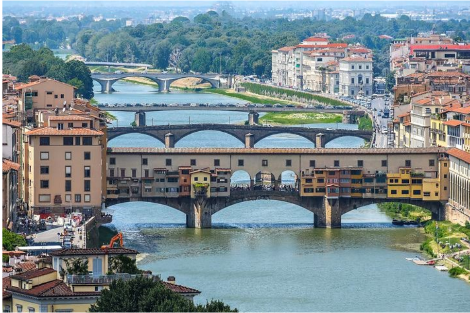
Ponte Vecchio, Firenze

Dante members, Lodge members, community members, students, friends and family are invited to experience the magnificent Treasures of Italy and Sicily on this all-inclusive tour in June 2019! The tour itinerary includes two nights in Venice, Florence, Rome, and Taormina, one night in Sorrento, and three nights in Palermo. We will also visit Verona, Assisi, Pompeii, and Siracusa. While in Palermo we will have free time to explore sights in Monreale, Agrigento and Cefalù or visit ancestral villages such as Lucca Sicula, Alia and Burgio.